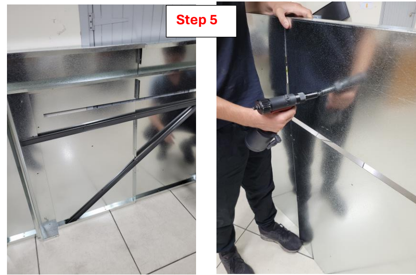
Pop rivet the horizontal strengthening bar across the 2 front panels and overlapping the diagonal bar AND the wall strips ( pls see assembly instructions for model <1.7m wide – backless ). The pop rivets are inserted from the front.