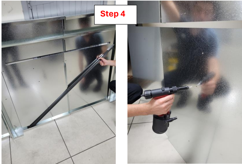
Pop rivet the diagonal strengthening bar across the 2 front panels. The pop rivets are inserted from the front.